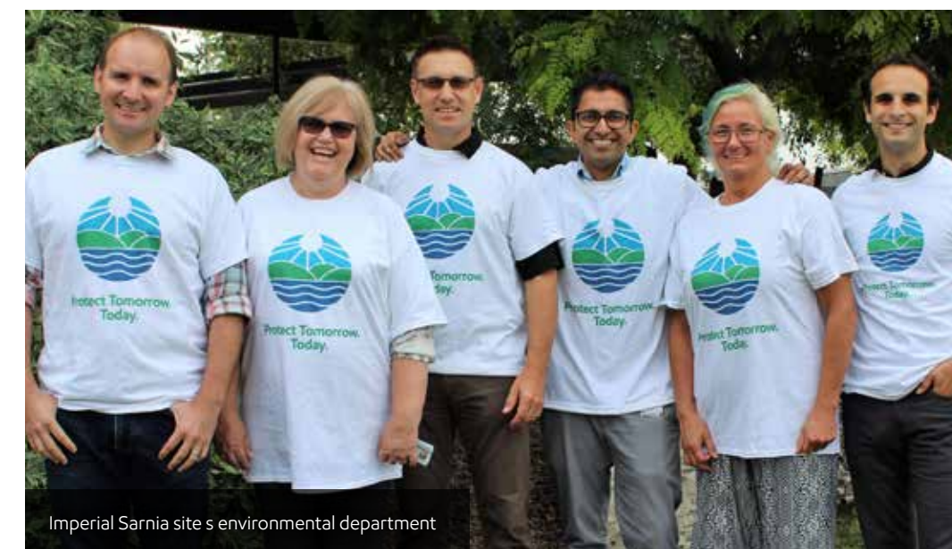
Imperial Sarnia site environmental department

At Imperial, we believe in protecting tomorrow, today. Since 1994, the Sarnia site has achieved an 88 percent reduction in benzene emissions and a 60 percent reduction in sulphur dioxide emissions. We are committed to meeting the requirements of the new regulation and ensuring communication with our community through the website.