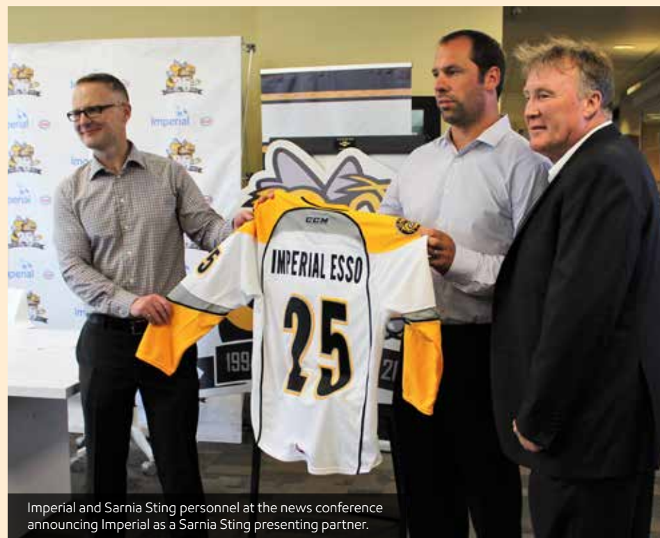
Imperial and Sarnia Sting personnel at the news conference announcing Imperial as a Sarnia Sting presenting partner.

An exciting community component of the agreement will see Imperial build on its current breakfast program with P.E. McGibbon school to include Sting players participating in the 'Breakfast of Champions.' This will allow the team to present positive role models to local youth by focusing on healthy living, hard work, dedication, teamwork and community. Imperial's sponsorship will also include four 'Skate with the Sting' events.