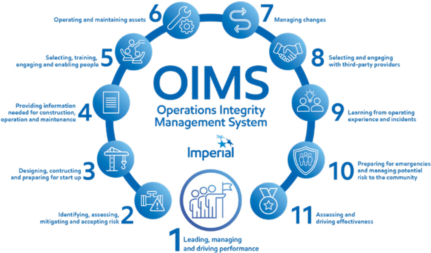
The 11 OIMS elements

Leaders are responsible for ensuring Management Systems to satisfy the OIMS framework are in place and effective. The scope, priority and pace of Management System implementation should be consistent with the risks associated with the business.