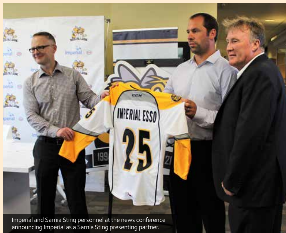
Imperial and Sarnia Sting personnel at the news conference announcing Imperial as a Sarnia Sting presenting partner.

An exciting community component of the agreement will see Imperial build on its current breakfast program with P.E. McGibbon school to include Sting players participating in the 'Breakfast of Champions.' This will allow the team to present positive role models to local youth by focusing on healthy living, hard work, dedication, teamwork and community. Imperial's sponsorship will also include four 'Skate with the Sting' events.