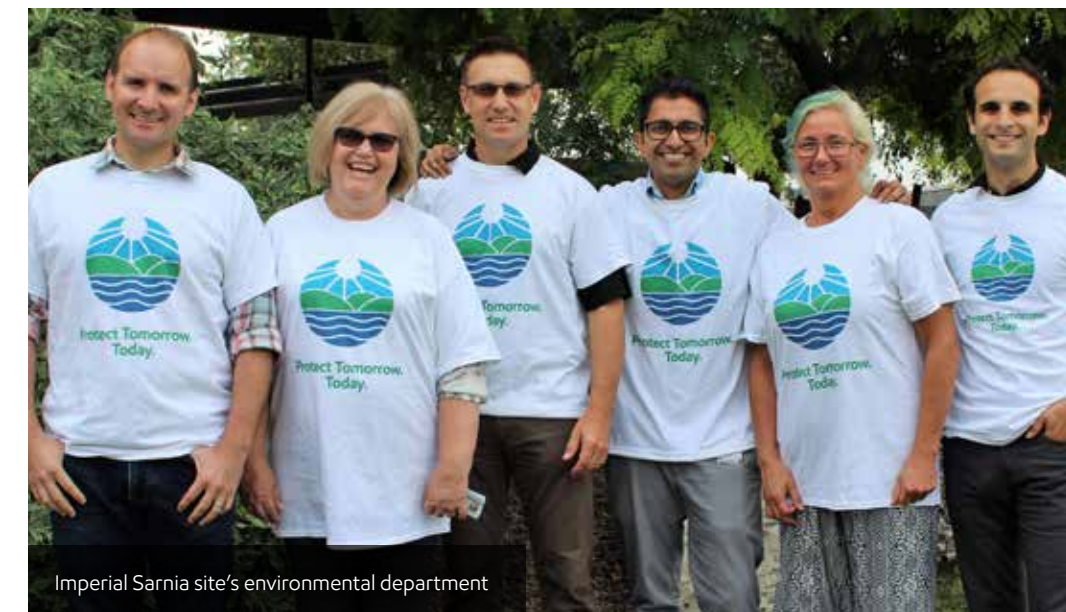
Imperial Sarnia site's environmental department

At Imperial, we believe in protecting tomorrow, today. Since 1994, the Sarnia site has achieved an 88 percent reduction in benzene emissions and a 60 percent reduction in sulphur dioxide emissions. We are committed to meeting the requirements of the new regulation and ensuring communication with our community through the website.