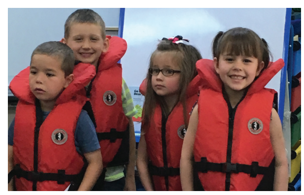
Norman Wells students received new life jackets, compasses and safety whistles from the Sahtu Search and Rescue Society.

Imperial's Norman Wells Partnering today, for tomorrow program seeks to identify opportunities to partner with Sahtu