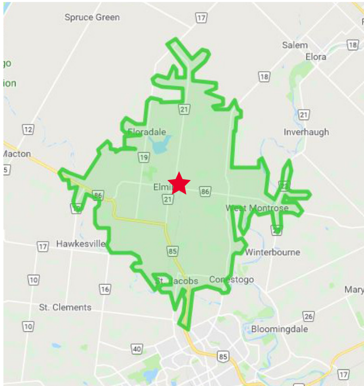
10-minute drive time