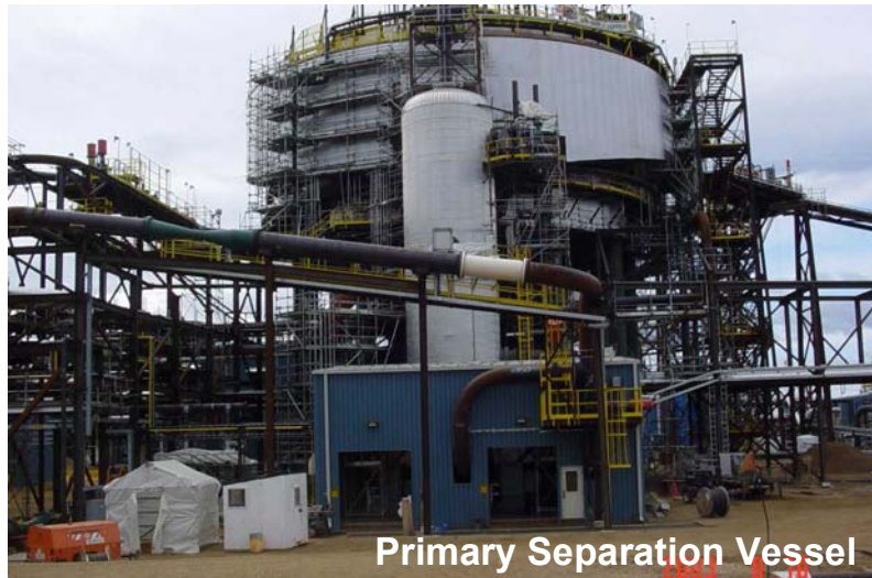
Primary Separation Vessel